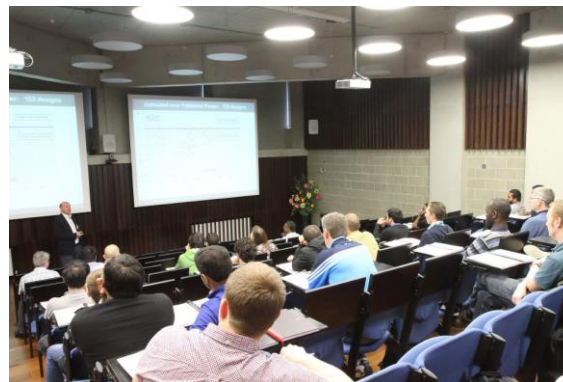
2018 Course: Prof. Bult IEEE SSC Magazine - Fall 2018